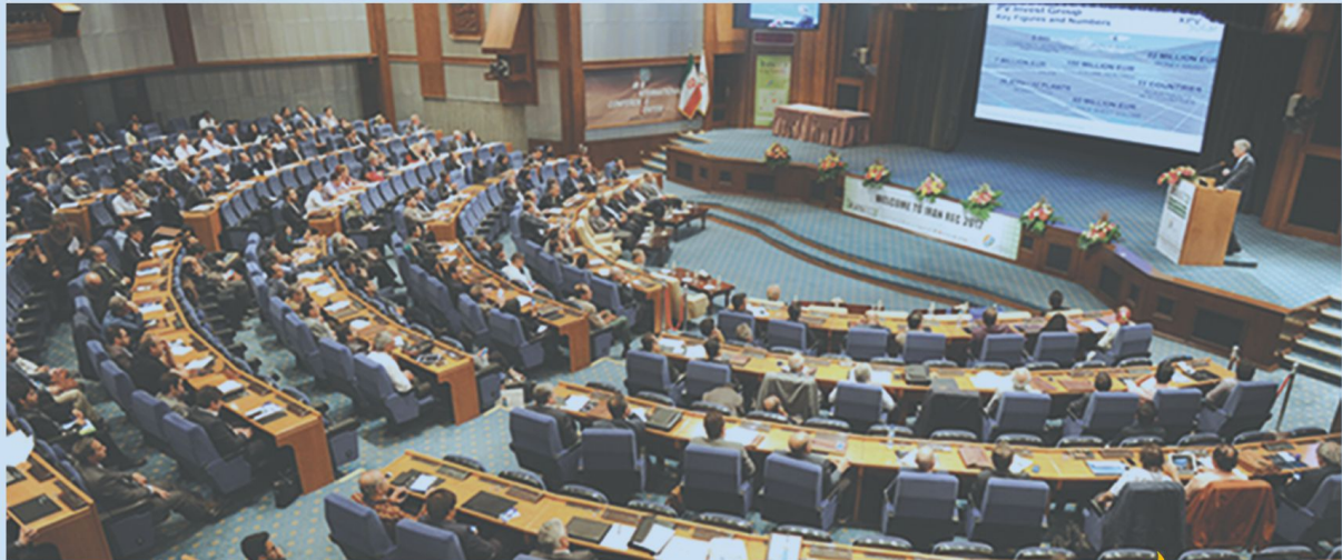
Iran Energy Efficiency Conference